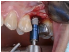
Implant placement using handpiece.