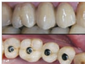
Superstructures in place on the implant level (no abutments) immediately after implant insertion.

Based upon this pilot study in two patients and an in vitro analysis, it appears that the use of reproducible fiducial markers consisting of mini-implants and reference brackets results in the fabrication of an acceptably accurately fitting definitive prosthesis prior to implant placement. Int J Oral Maxillofac Implants 2011;26:707–717.