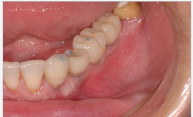
Fig. 10 Occlusion check of the final restauration.