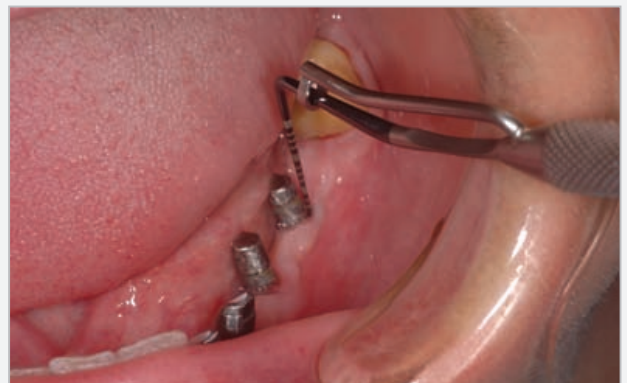
Fig. 6a. Parodontometer AESCULAP measuring device. Note the perfect soft tissue healing after removal of the provisional restoration.