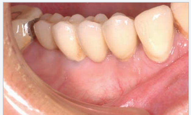
Fig. 4 Final restauration at 2 years.