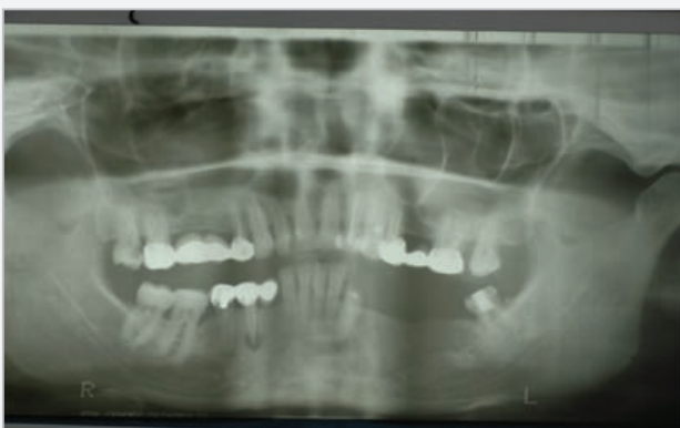
Fig. 5a. Preoperative x-ray. Narrow mandibular ridge.