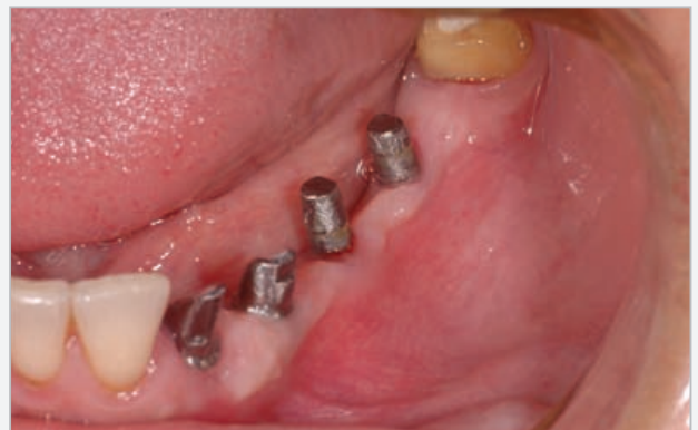
Fig. 6a. Parodontometer AESCULAP measuring device. Note the perfect soft tissue healing after removal of the provisional restoration.