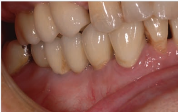
Fig. 7 Final restauration at one year after insertion.