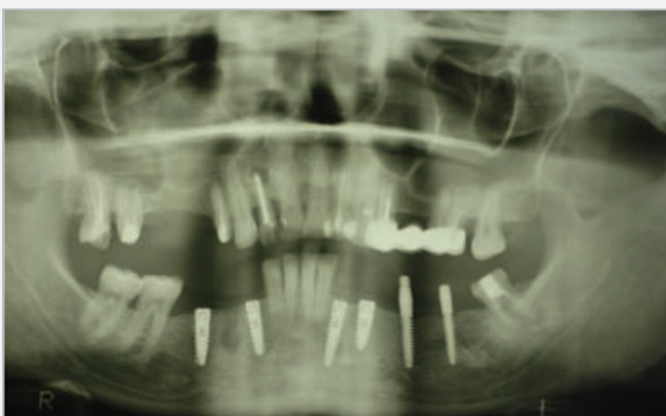
Fig. 5b. Preoperative x-ray. Narrow mandibular ridge.