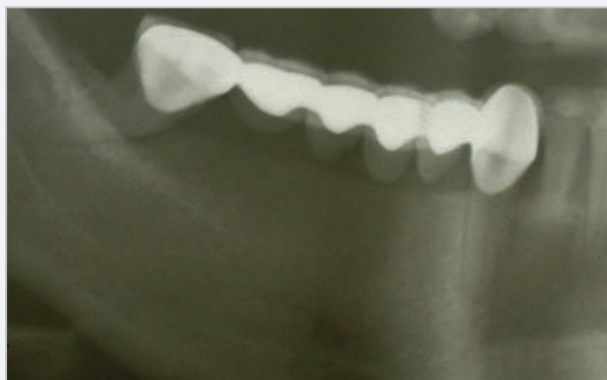
Fig. 1 Preoperative view, narrow ridge, 4,5mm at top of the crest.

1 Department of Implant supported restorations University of Medicine and Pharmacy Timisoara Romania